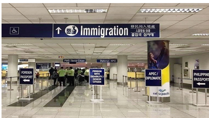
Toll Plaza: Sample Deployment