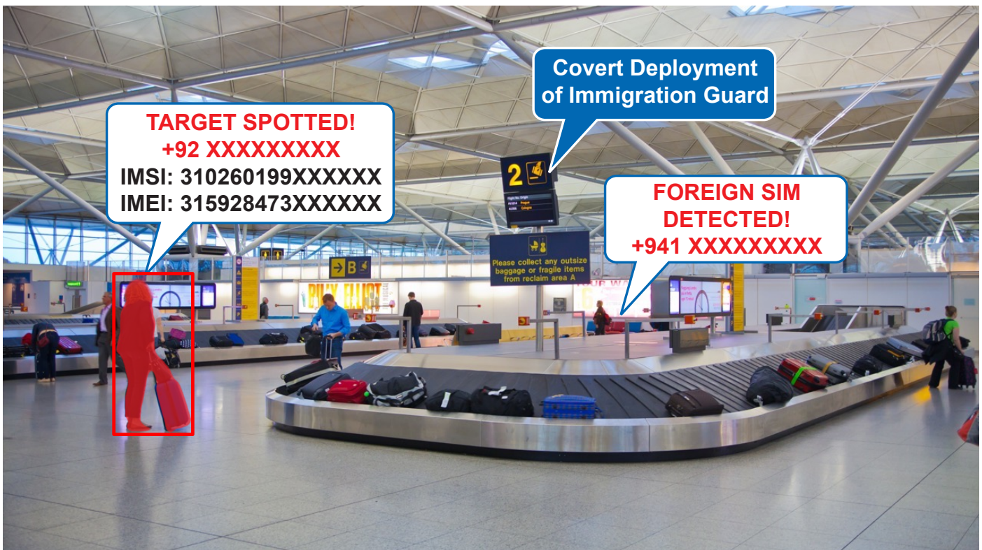
Use Case 3: Luggage belt – 3rd Check

Only for Sale to Indian Govt. Approved Specific Organizations and for Export