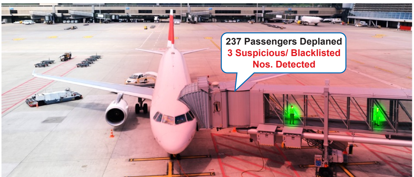
Use Case 1 – Aerobridge – 1st Check

Only for Sale to Indian Govt. Approved Specific Organizations and for Export